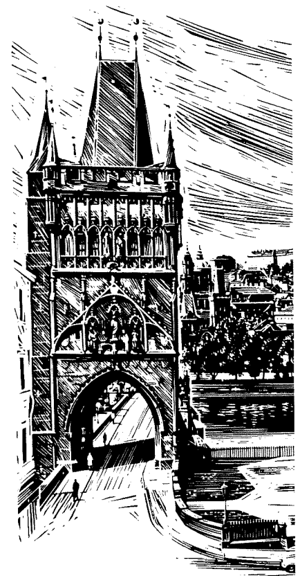
Illustration from Turista Mondo

La Karlo-Ponto trans la Moldavo komen- ciĝas kaj finiĝas kun fortegaj turoj laŭ la plano de Peter Parler, la fama arkitekto de la tiama epoko.